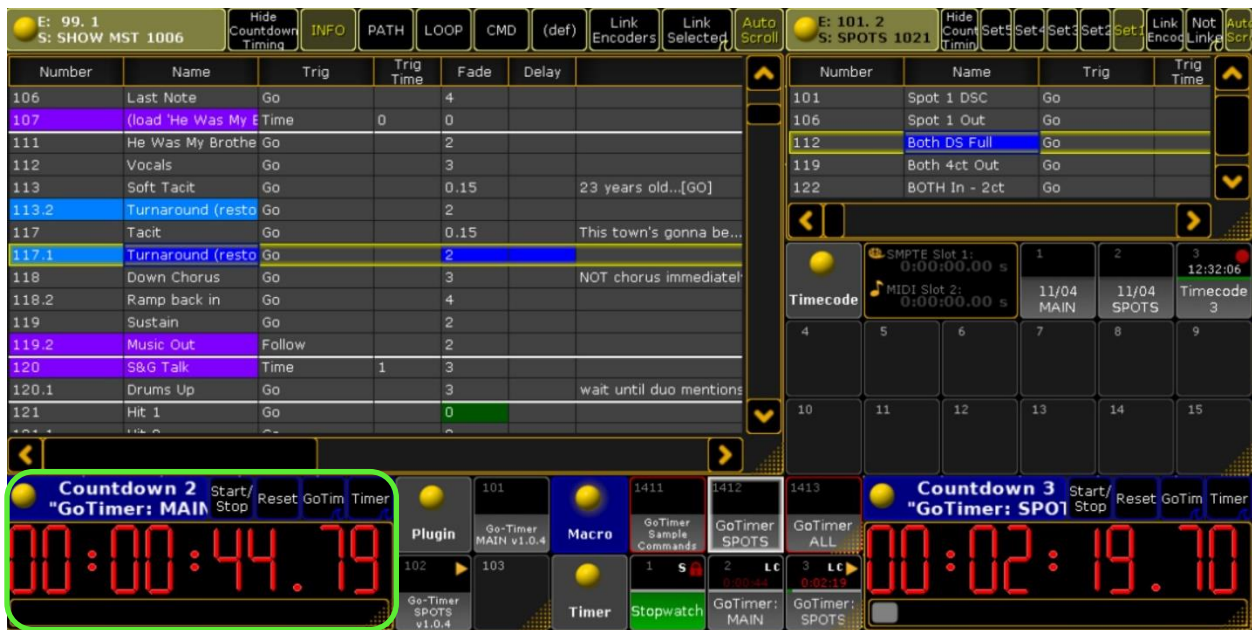
Fig. 3: plugin running with show

Before triggering your first [GO] cue, run the macro that loads the plugin. After each [GO] of the defined cueлист, the timer should now run a countdown to the next [GO] recorded in the timecode sequence.